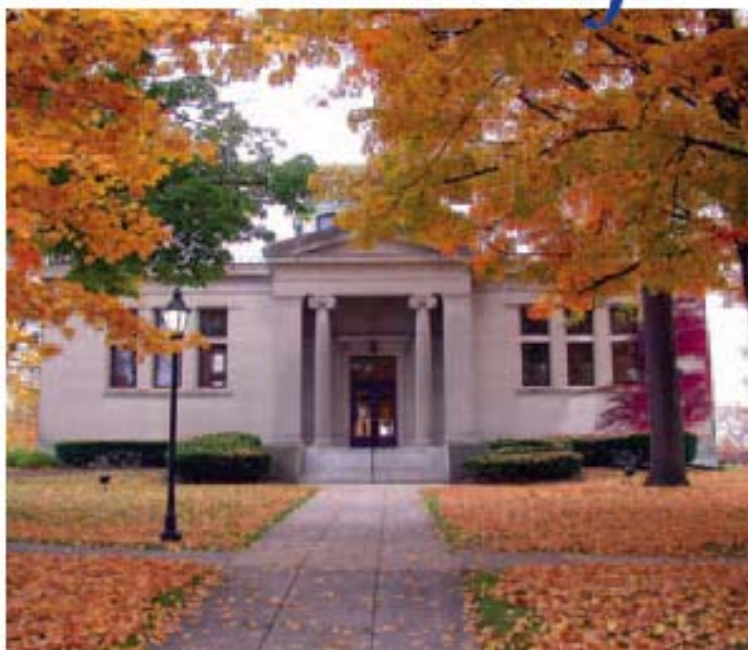
MOVIE ▶ Suffield Academy library

Fortunately, the advantages outweigh any inconvenience that may come from a few lost hours of sleep. You will get to know your teammates as well as you know your own family. People who were perfect strangers when you first set foot on campus will quickly become lifelong friends. Your coaches will push you to reach goals that you once might have thought were unachievable.